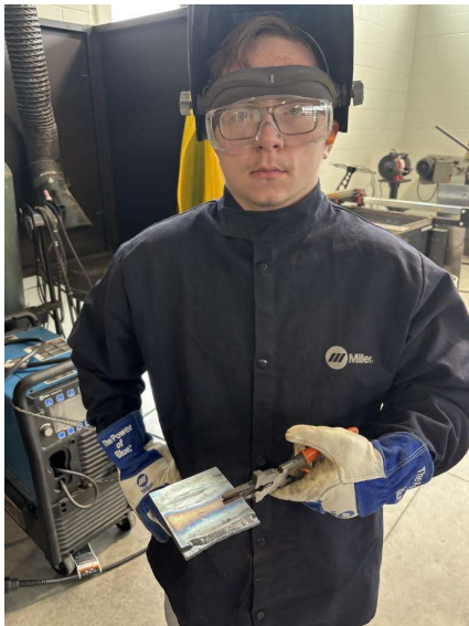
A student displays his TIG welding bead