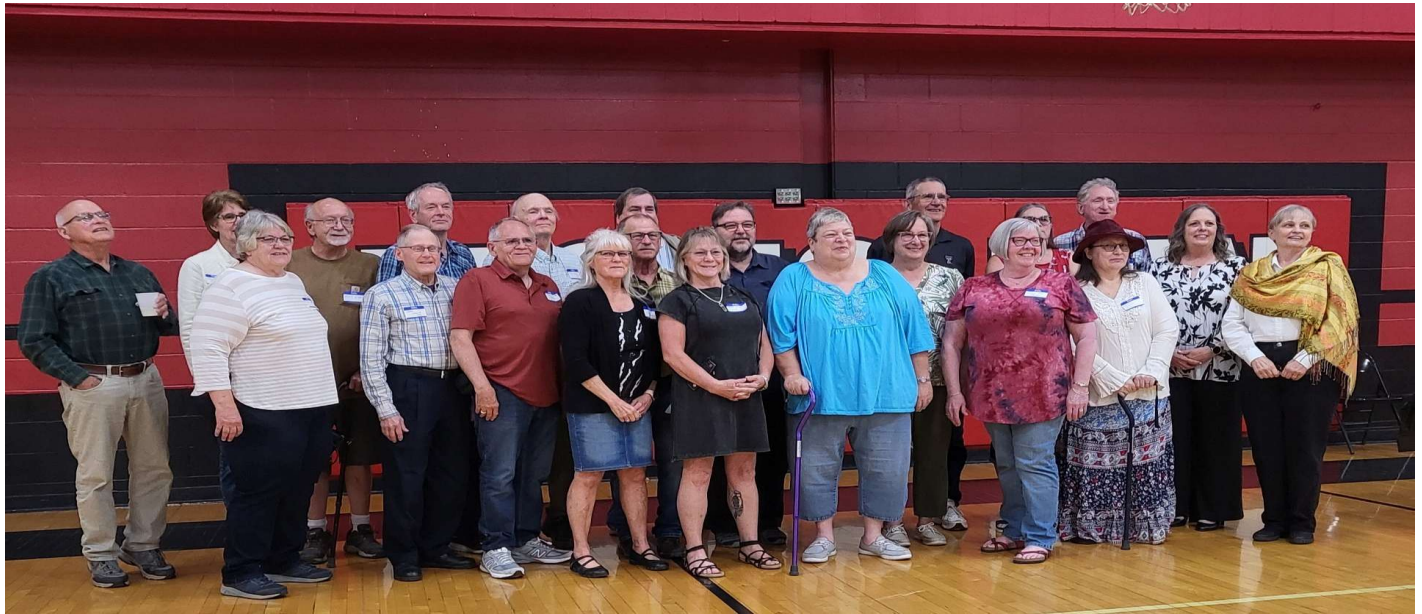
The class of 1975 gathered at the 2025 Banquet to celebrate 50 years since graduation.