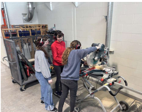
Students demonstrate proper safety and tool use on the miter box saw