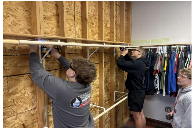
Construction Technology students assist with installing new shelving in the school sponsored Caring Closet