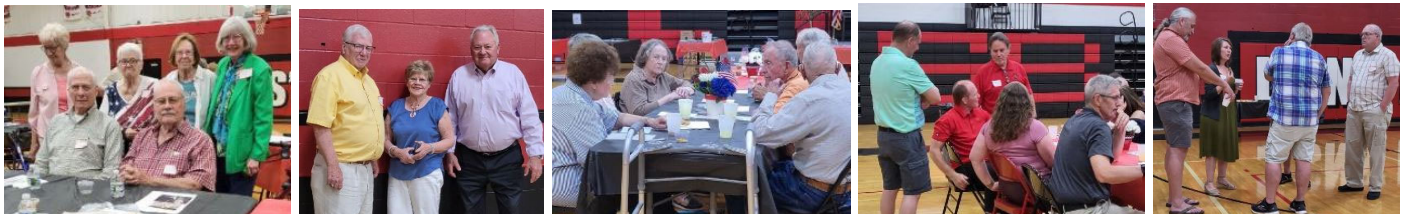
Snap shots from the Lisbon Alumni Association 2023 Annual Banquet.

We are always looking for additional LHS Alumni to be active with our ongoing group that meets regularly throughout the year. While we have a small group of dedicated, active members, and we welcome others. Upcoming meetings information is sent through the Lisbon Daily Pride a few days in advance. During our meetings, we discuss ongoing LAA needs, including ways to improve reaching more alumni through social media and email. Due to the significant expense to print and mail the Newsletter, we will be distributing via our FB page and by email only going forward. If you are interested in being involved in our meetings, or if you want to continue to receive a printed copy of the Newsletter, please contact us. Thank you!